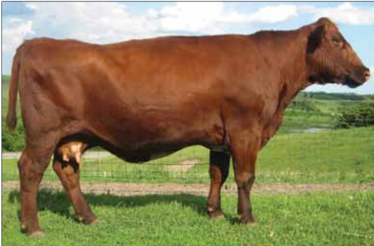
MTS Red Queen 93