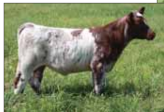
LOT 5A - DSF Fantasy Girl 56U