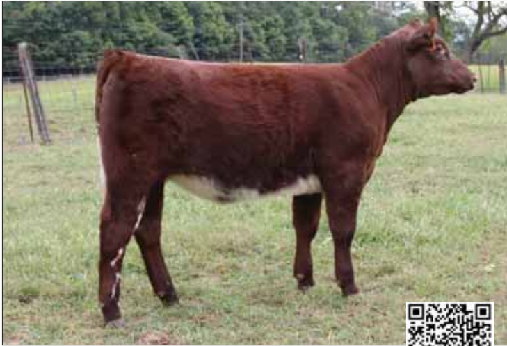
LOT 7 - SF Lila's Girl