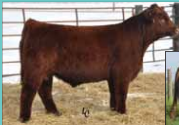
JSF Marquis 127X

"The best thing about the future is it comes one day at a time."