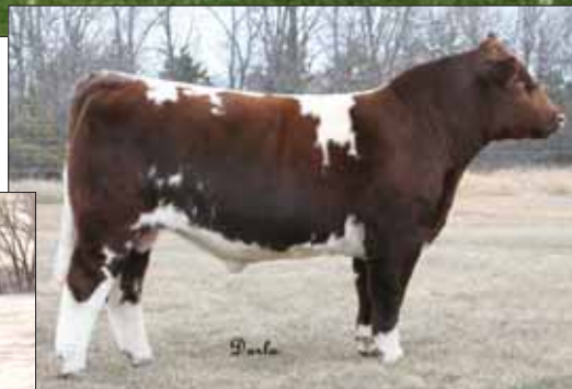
Mitch's Sedge Puff 417