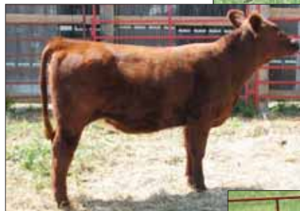
LOT 4 - MTS County Dancer 2010