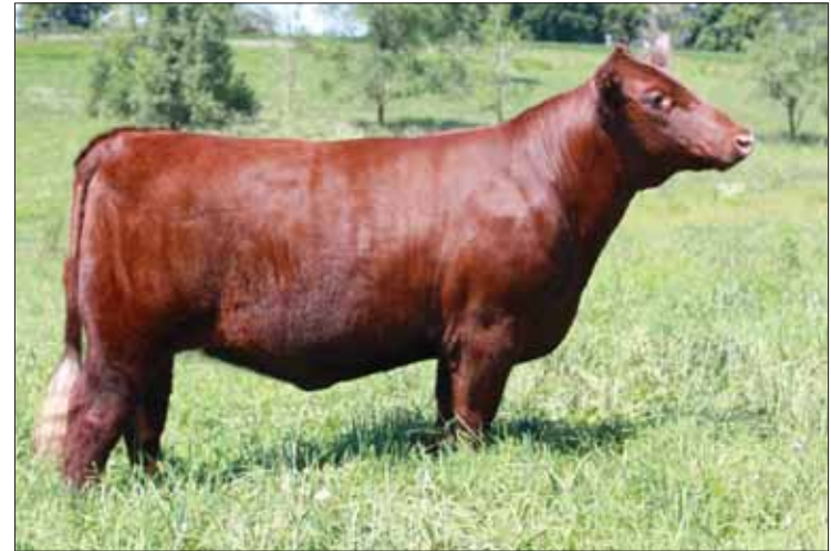
DSF Lila's Girl 8W, dam of Lot 7 and 8 embryos