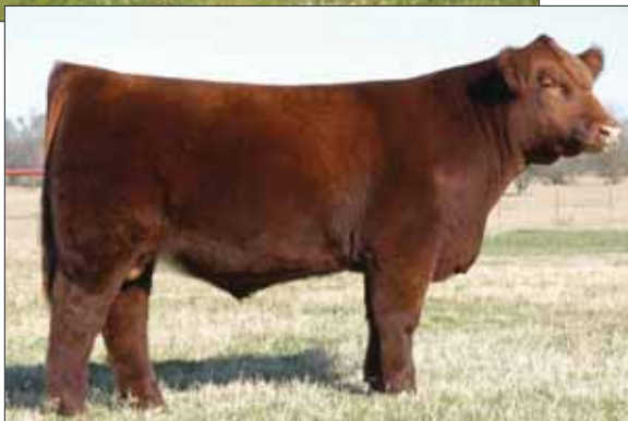
DF Waco ET *x