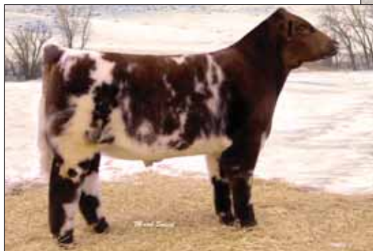
Hi View's Ace of Diamonds