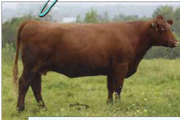
Shadybrook Quinana 90P