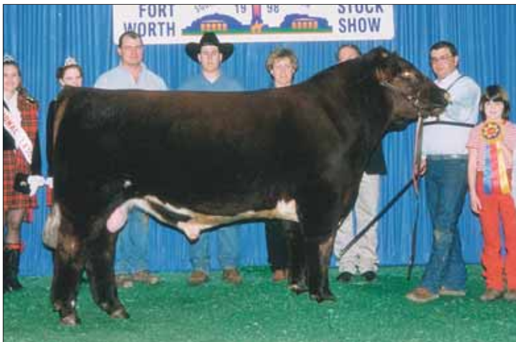
Studers Pretender 96th