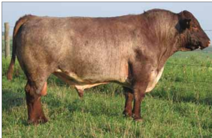
Eionmor Marquis 86G, sire of Lot 42