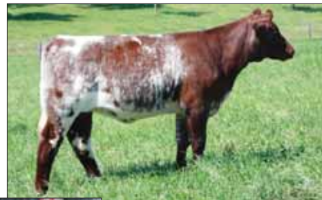
LOT 3 - DSF Rona 41Y